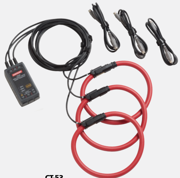
CT-53 Flex Current Sensor

← . . . . High performance processor for accurate, detailed data recordings